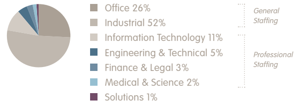
2011 Revenue split by business line in %